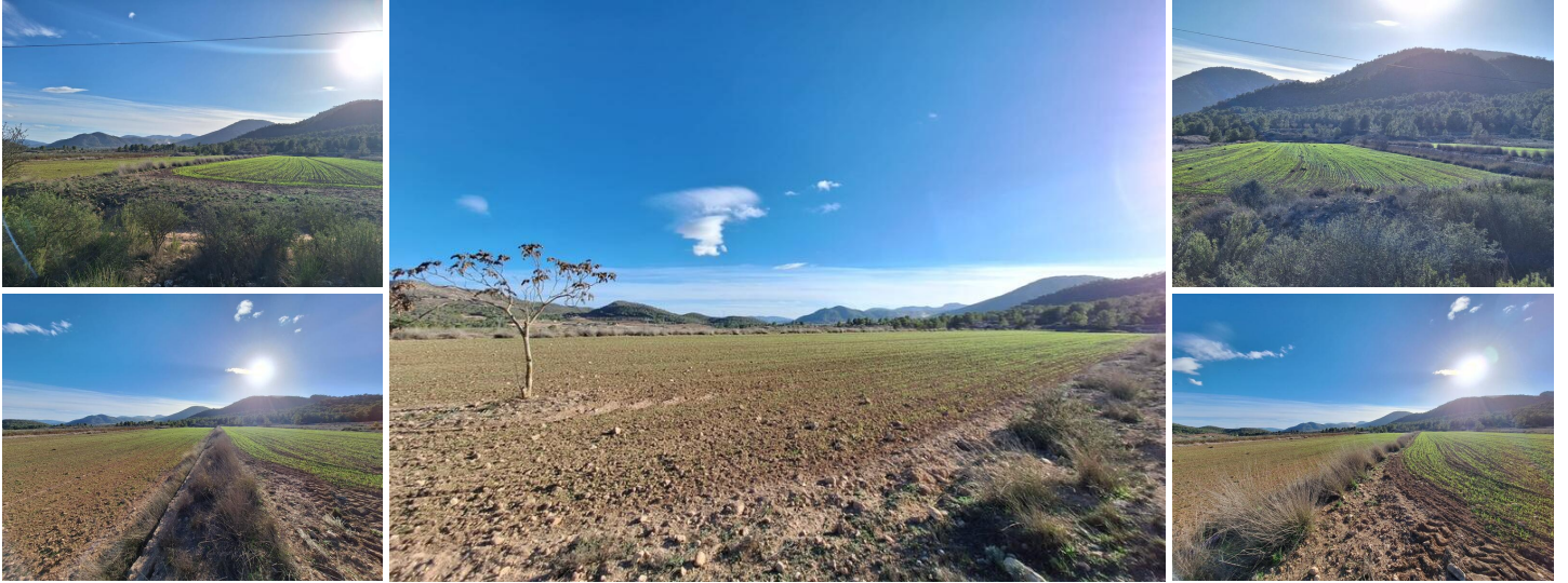
Plot with Stunning Views Located Between Pinoso and Monóvar

This beautiful building plot offers breathtaking views of the surrounding mountains, nestled amidst expansive vineyards and almond groves. The plot features two large terraces and its own natural area, perfect for relaxing walks right from your future new-build home.