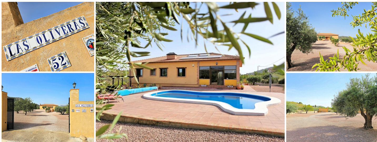
Villa in La Zarza with Privacy and Pool

Discover this beautifully situated villa in the sought-after region of La Zarza, near the village of Pinoso. Built in 2006, this property offers an oasis of peace, space, and nature on a generous plot of 3,778 m 2 .