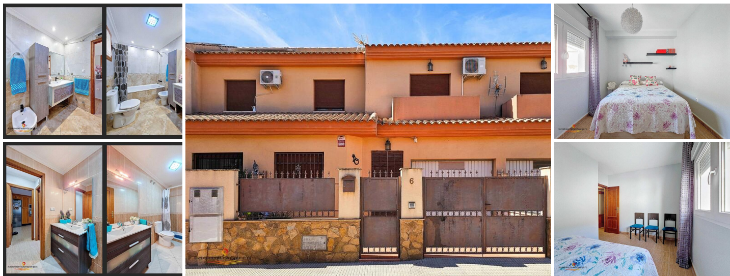
Townhouse with Garage and Basement in Pinoso

Living in the charming town of Pinoso, where all amenities, such as shops, restaurants, schools, sports facilities, and medical services, are within walking distance? This spacious townhouse is situated on a quiet street with ample parking and even features its own garage. At the front of the house, there is a large, tiled terrace, while a cozy patio awaits at the rear. Additionally, one of the upstairs bedrooms has a balcony, allowing you to fully enjoy the Spanish outdoor lifestyle.