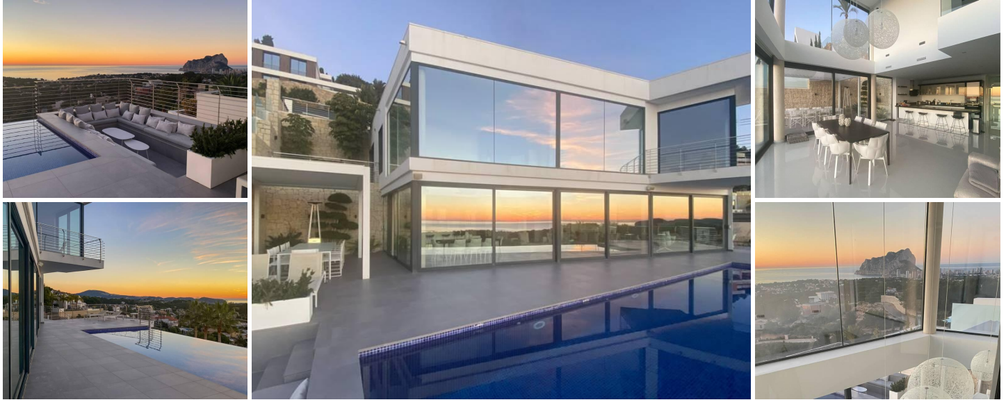
Luxury Villa in Raco de Galeno - Breathtaking Sea Views and Unprecedented Luxury

In the prestigious residential area of Raco de Galeno, just 1,500 meters from the Mediterranean Sea, stands this extraordinary villa that offers everything you could want. With spectacular views of the sea and the iconic Peñón de Ifach, and unparalleled design, this is the property for those looking for ultimate luxury and comfort.