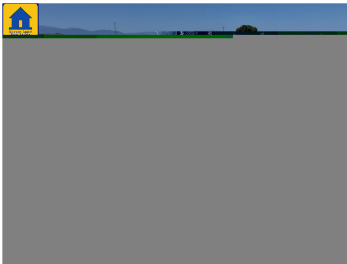
Cueva Joana in Gor

Cueva Joana is located on a ridge high above the impressive Gor Canyon in the Granada Geopark. This property faces east-southeast and consists of a large rambling cave house with a massive front patio, a 2-car garage with a workshop, and 1800m 2 of open land with 650m 2 fenced area and 4-car carport. The house has a living room, 2 dining rooms, kitchen, a pantry, 3-5 bedrooms and one bathroom. The property has tons of potential as a family home with a workshop, a business, or for tourism.