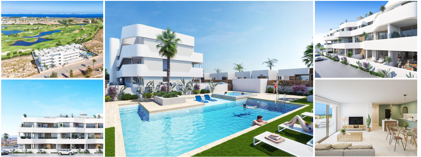
New Build Residential complex in Los Alcazares

Los Alcázares is an idyllic location for those looking to invest in a new residential property on the Costa Cálida. Just 25 minutes from Murcia Airport and approximately 55 minutes from Alicante Airport, this area is conveniently connected by highway to major cities like Cartagena, Murcia, and Alicante, as well as to other beautiful beaches along the Costa Cálida and Costa Blanca.