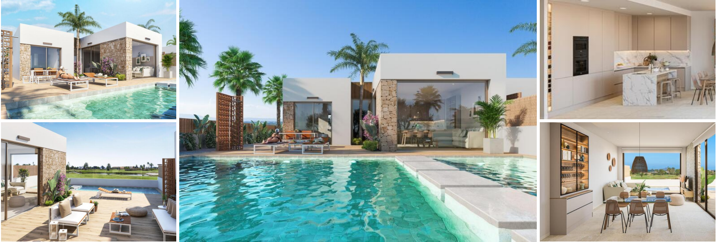
New Build Villas in Los Alcazares

Los Alcázares is an idyllic location for those looking to invest in a new residential property on the Costa Cálida. Just 25 minutes from Murcia Airport and approximately 55 minutes from Alicante Airport, this area is conveniently connected by highway to major cities like Cartagena, Murcia, and Alicante, as well as to other beautiful beaches along the Costa Cálida and Costa Blanca.