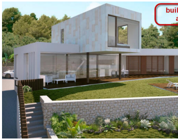
Planta Sótano Basement Floor