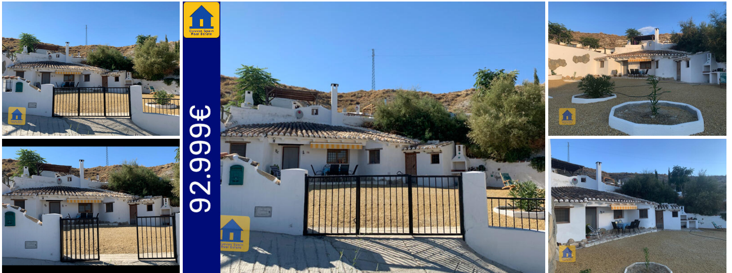
Cave Mabs in Galera

This is one of the beautiful caves found in the village of Galera. This property is located in the heights of Galera and has stunning views over the mountain ranges. It has an expansive, gated patio with potential for a garden, jacuzzi or above ground pool. From the patio, you enter the spacious living/dining room with high ceilings and lots of light. To the right is a lovely, fully fitted kitchen. Straight ahead upon entering is a hall area leading to two bedrooms. To the left is a bathroom and hallway leading to the master bedroom with ensuite bathroom. Outside, to the right of the cave, is a utility room with the washing machine and storage space. This cave is impeccably designed and maintained with great taste and care. The property can be purchased fully furnished (negotiable) and is ready to move in. The village center with amenities, restaurants and tapas is a 10-15 min walk away.