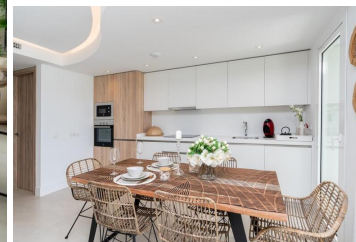
2 Bedroom Middle Floor Apartment with Amazing Golf Views in San Roque Club, Sotogrande Alto, Cádiz

This 2-bedroom middle floor apartment boasts stunning golf course views and is situated in an idyllic location. From the moment you step inside, you'll feel a strong connection with nature as you're greeted by breathtaking views of the golf course and its surroundings.