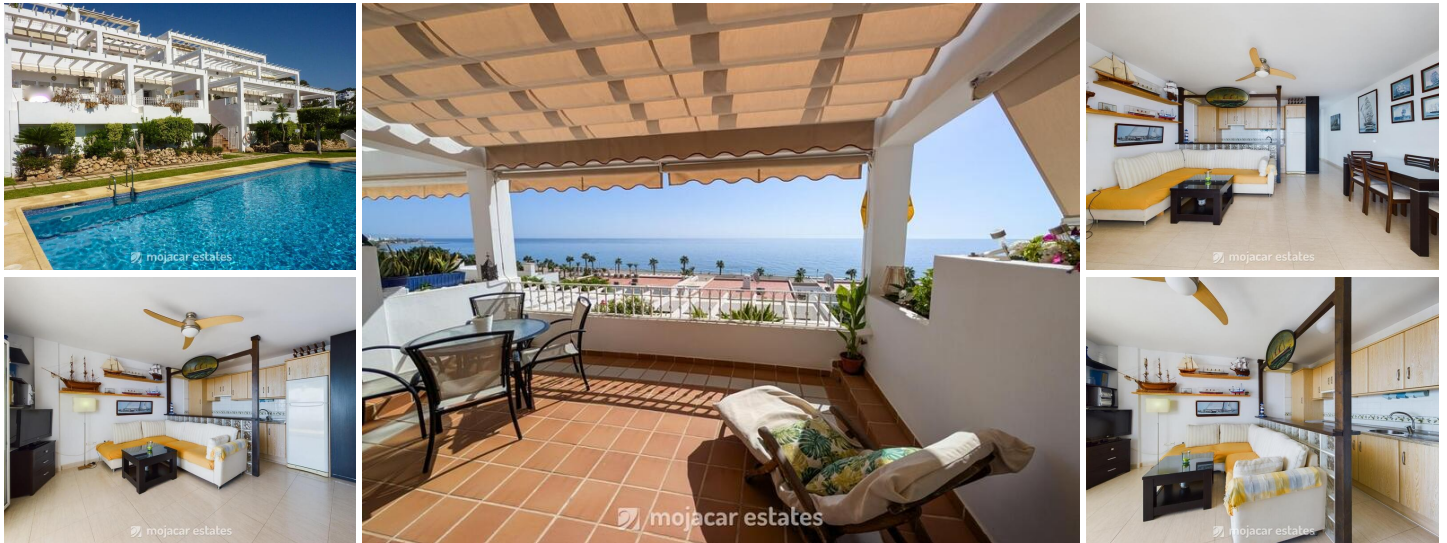
Mojacar Beachfront Apartment for Sale – Terrace, Pool, and Parking on Mojacar Playa, Almeria, Andalusia.