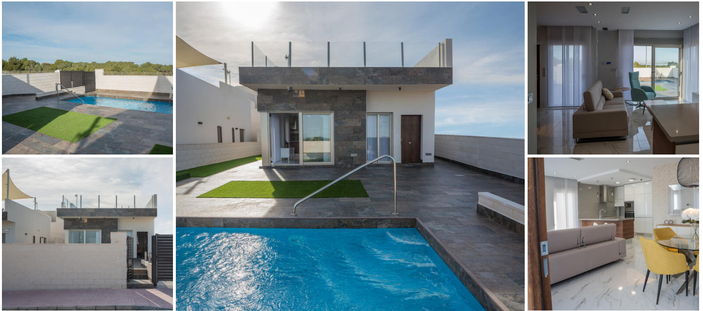
One Level Detached Villas with Private Pool in Playa Flamenca