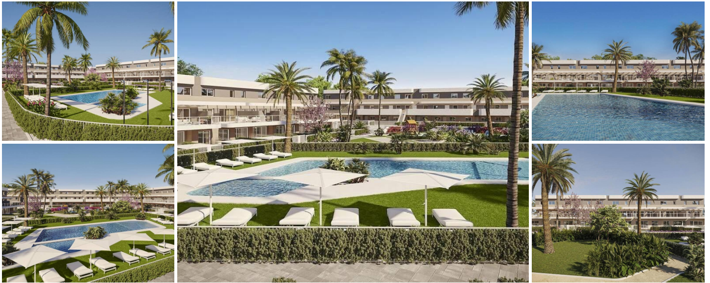
NEW BUILD RESIDENTIAL COMPLEX IN ALENDA GOLF, ALICANTE

New Build private development of beautiful 2 and 3 bedrooms apartments with large terraces overlooking the nice communal area, combines the tranquil area of the Alenda Golf Course with a more lively beachfront nightlife easily accessible in just 15 minutes.