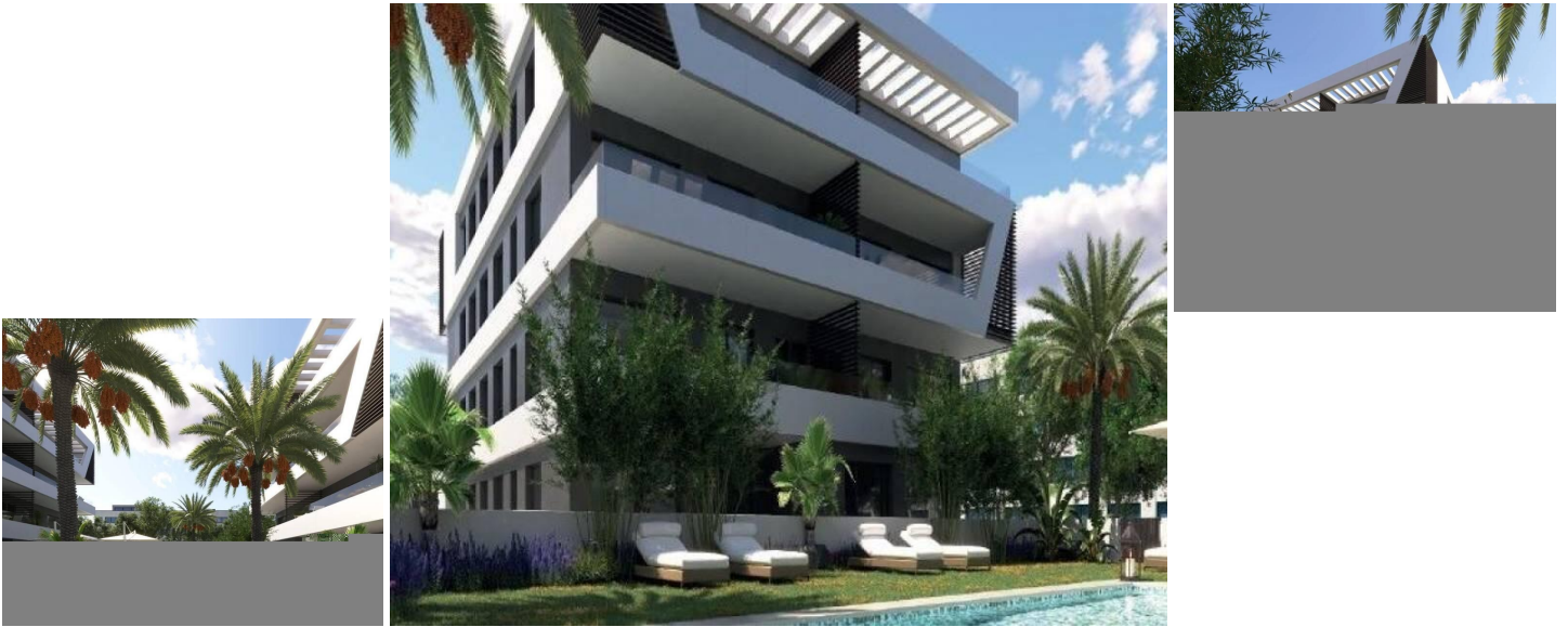
NEW BUILD RESIDENTIAL COMPLEX IN SAN JUAN DE ALICANTE

New Build residential complex of 32 modern apartments and penthouses located in the Nou Nazareth area in San Juan de Alicante.