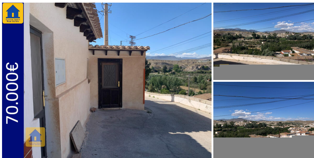
Cueva Serafin in Galera

This is a quirky, traditional, Spanish cave house with great views over the popular village of Galera! This property can be lived in right away or you could do some modernising to create a truly delightful home for holidays or full time living. Parking is at the front of the property. Amenities are a 5 min walk into the village.