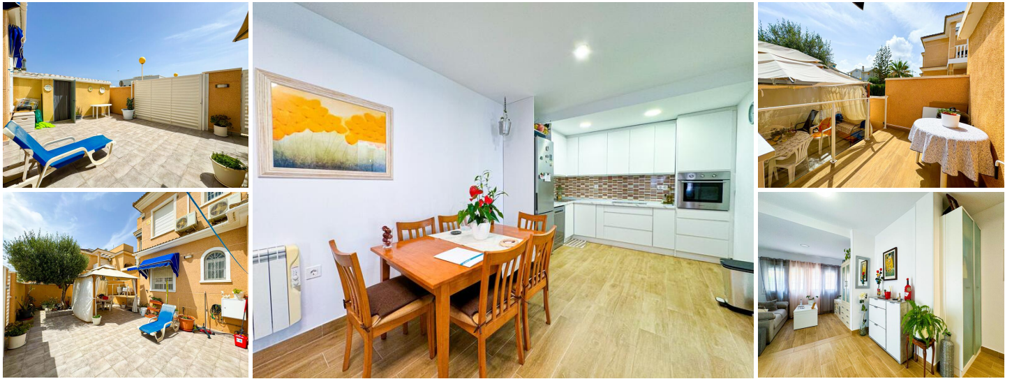
Ground floor apartment located in La Zenia, Orihuela Costa.

The property has a living-dining room, kitchen, 2 bedrooms and 1 bathroom. This apartment is south facing and has a large garden with private parking space. Only 600 meters from the sea.