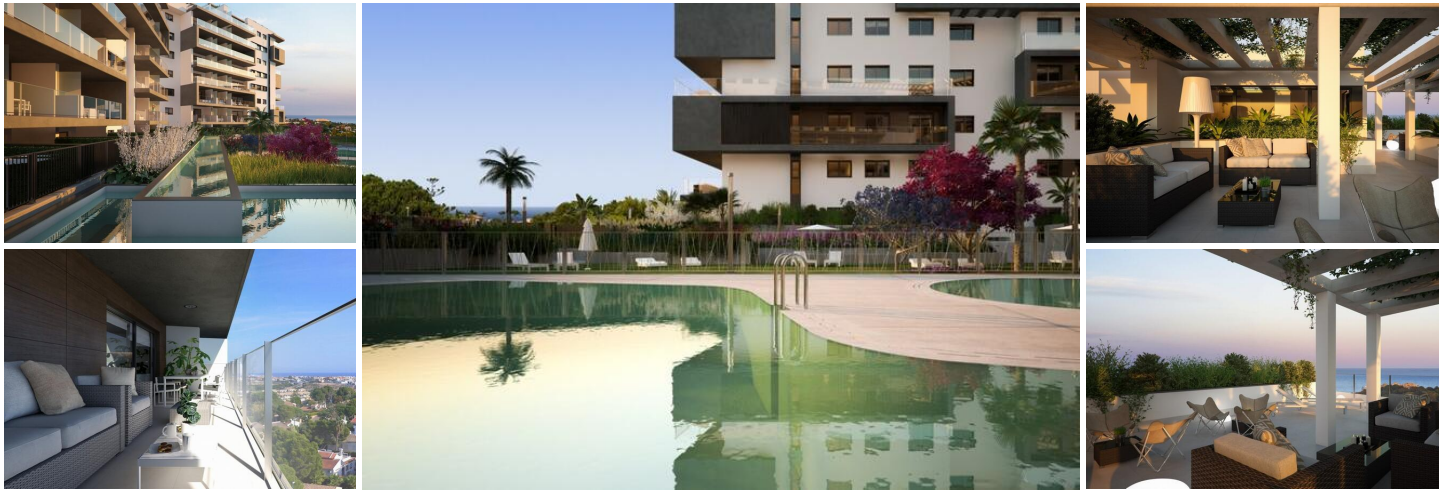
GROUND FLOOR FLAT IN LUXURY RESIDENTIAL COMPLEX NEXT TO THE SEA

Imagine a place where the sea and nature become the protagonists of an incredible story: yours. Imagine an environment where you can give free rein to your imagination and live a thousand adventures by land sea. Welcome to this new Residential in Campoamor, the home where you can live the life you have always dreamed of with the most beautiful horizon in the background: the Mediterranean.