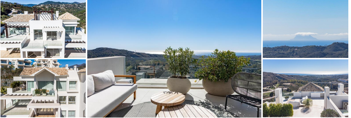
Penthouse with 3 Bedroom and 2 bathrooms

Welcome to Marbella Club Hills, an exquisite luxury development nestled amidst the picturesque hills of Benahavis, right beside the prestigious Marbella Golf Club. This extraordinary resort comprises 110 opulent apartments, each enveloped by lush green hills, offering breathtaking vistas that stretch across the Mediterranean Sea, the iconic silhouette of Gibraltar, and even the majestic Atlas Mountains.