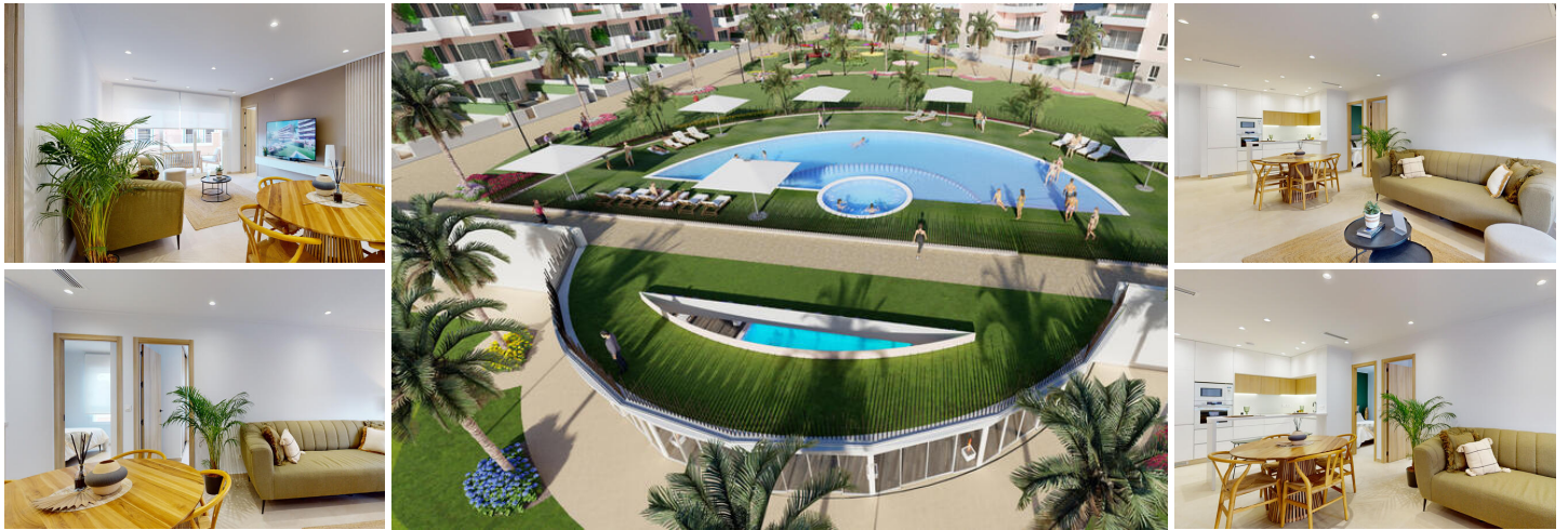
Great Lux Apartment with SPA Area in El Raso.

3 bedrooms 2 bathrooms Communal Pools SPA area Gym Terrace