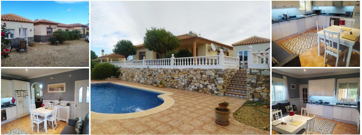
Villa Florence - A villa in the Arboleas area. (Resale)

A rare to the market rambla front Lakes Vega built villa with exceptional views within within easy walking distance of Arboleas town centre, an exceptionally spacious 3 bed, 3 bath villa with high quality specifications with a beautifully appointed detached 1 bed, 1 bath guest apartment, 10x5 swimming pool, conservatory all set in beautiful gardens of 1355m 2 .