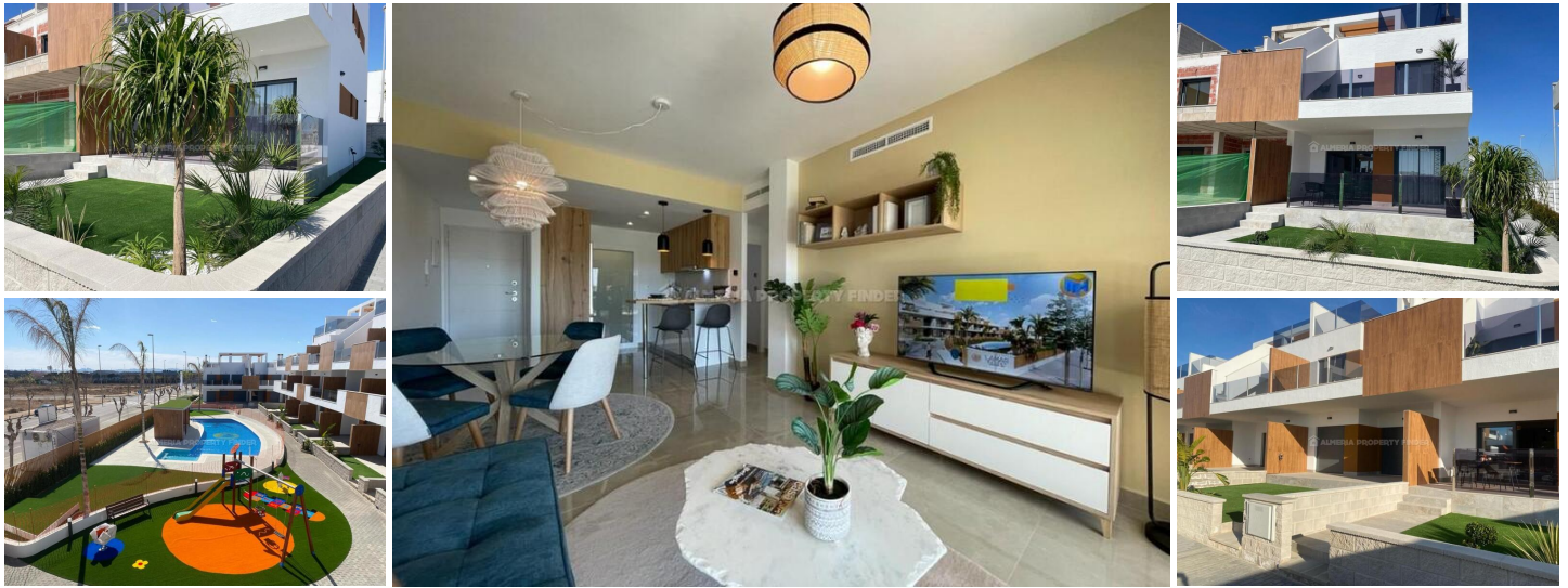
Lamar Resort Vii A13-b2 - An apartment in the Pilar de la Horadada area. (Newly Built)

LAMAR Resort Luxury VII is a luxury project of 34 apartments with 2/3 bedrooms and 2 bathrooms divided into 3 blocks with communal swimming pool, jacuzzi, gym, playground and garage with storage room. The ground floor apartments have large gardens, the first floor has terraces and the penthouses have a solarium with jacuzzi. The facades of these buildings are clad with high-quality ceramic tiles combined with a white dirt-resistant monolayer.