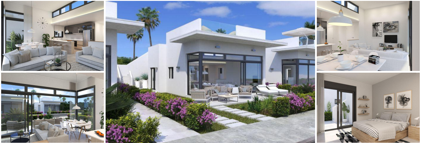
MEDITERRANEAN VILLA ON THE GOLF COURSE

Villa next to the golf course in Alhama.