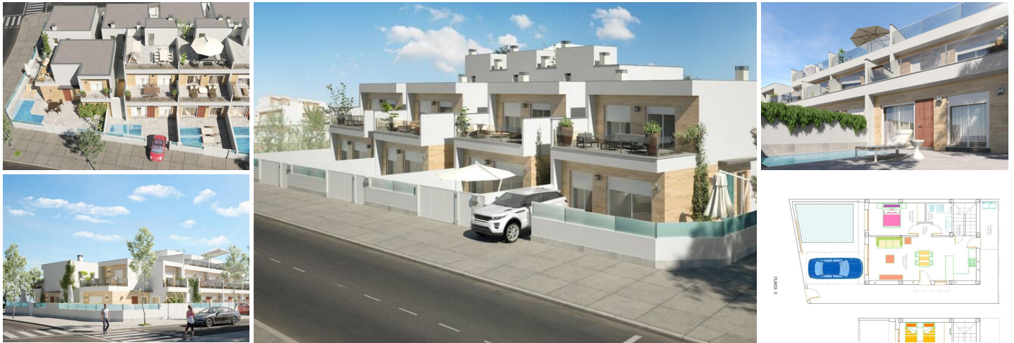
NEW BUILD VILLAS IN SAN PEDRO DEL PINATAR

New build development of 8 independent villas and semi-detached villas in San Pedro Pinatar, all with private swimming pool, terrace and parking space within the plot.