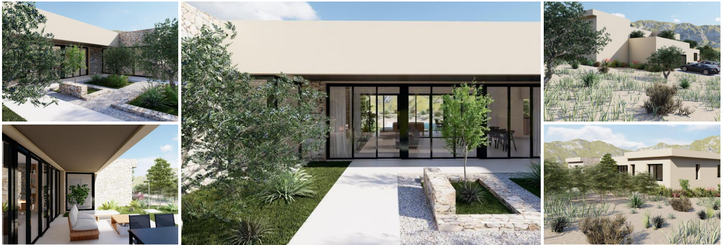
NEW BUILD VILLA IN YECLA, MURCIA

New Build exclusive luxury villa located within a beautiful vineyard in Yecla, Murcia.