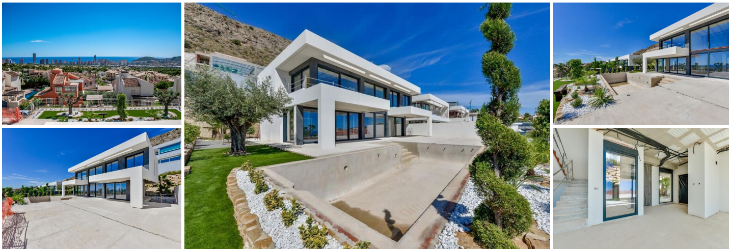
NEW BUILD LUXURY VILLA IN FINESTRAT WITH THE SEA VIEWS

New Build Luxury villa with the sea views in Sierra Cortina, Finestrat.