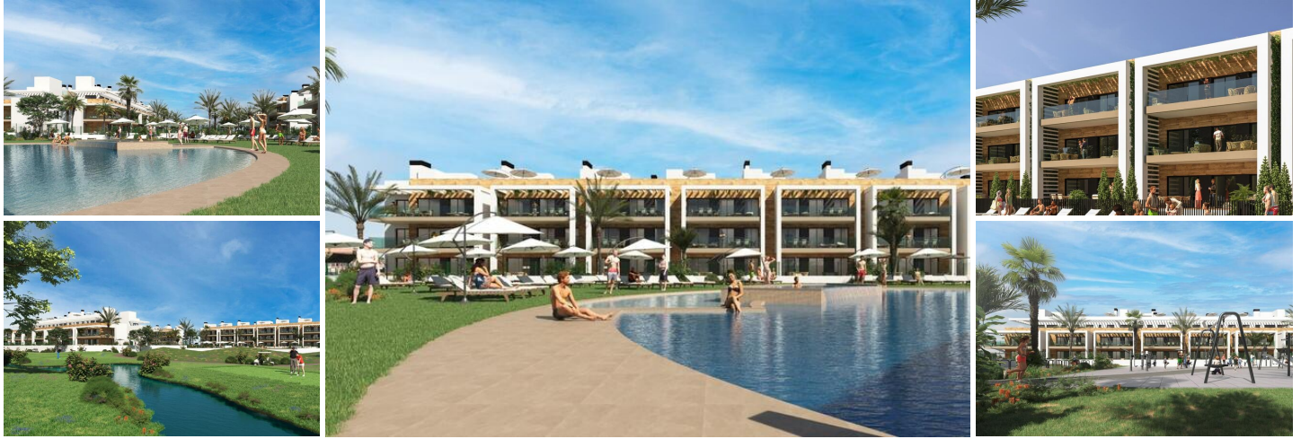
NEW BUILD RESIDENTIAL COMPLEX NEAR LA SERENA GOLF, LOS ALCAZARES

This amazing complex will be formed by 244 apartments with 2 and 3 bedrooms, divided in 8 blocks and 20 private Villas.