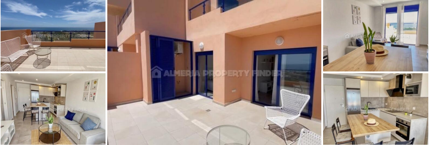
Apartment Mirador - An apartment in the Mojacar Playa area. (Under Construction)