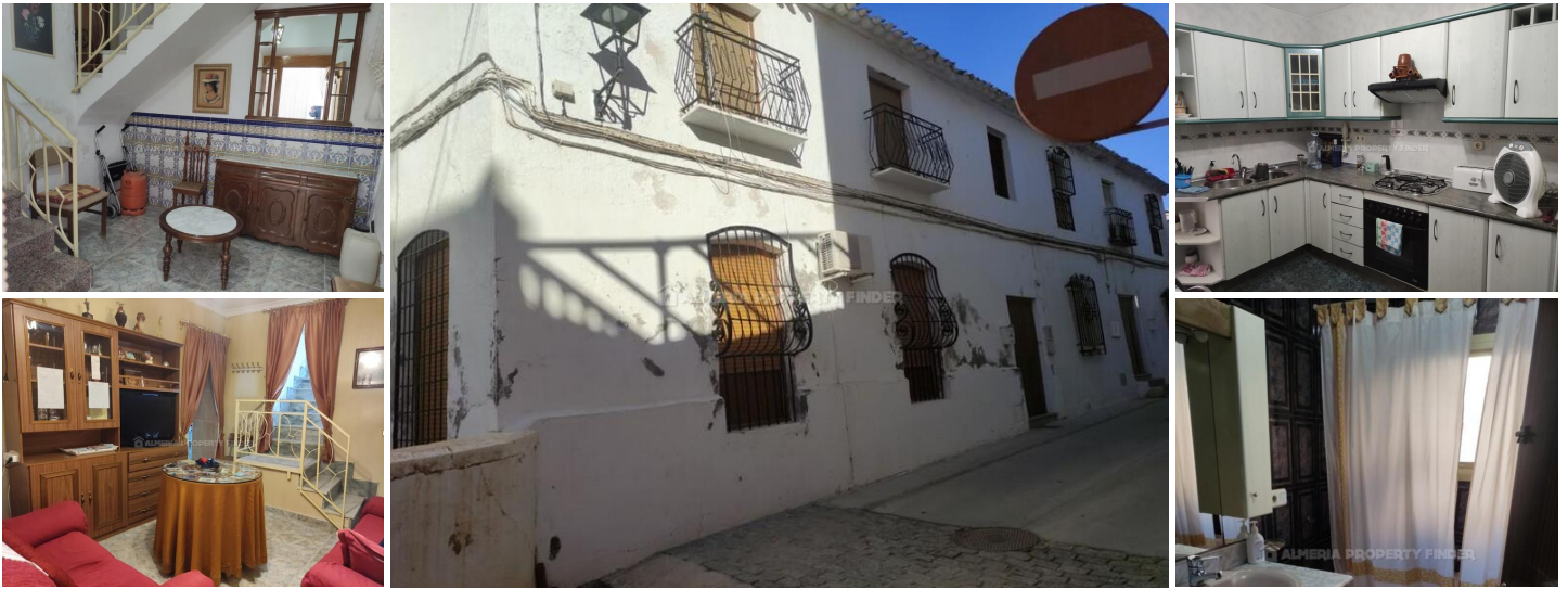
Casa Porta - A village house in the Zurgena area. (Habitable)

This habitable village house with 4 bedrooms and 1 bathroom, fully equipped kitchen, living room, entrance hall and courtyard is located in the center of Zurgena.