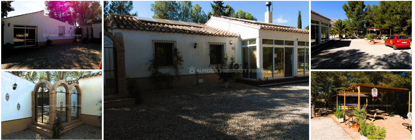
Casa Los Pinos - A country house in the Velez Rubio area. (Renovated)

Cortijo with 166 m 2 built area, 2,903 m 2 plot area, fully fenced, electric entrance gate, garden, tennis court, petanque court, covered outdoor bar, storage rooms, terraces, covered terrace, swimming pool with heat pump, solar panels, 5 bedrooms, 3 bathrooms, 2 dining areas, 2 living areas, 2 kitchens, 4 toilets, air conditioning, central heating, wood stove