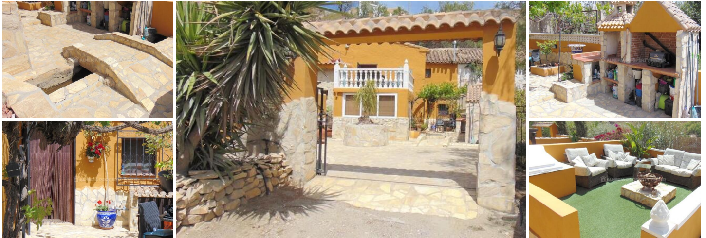
Cortijo El Oasis - A country house in the Albox area. (Renovated)

This beautiful renovated cortijo in Los Molinos (Albox) is an oasis of peace. The cortijo consists of a fully equipped kitchen, bathroom with walk-in shower, a separate toilet, 3 bedrooms of which the master bedroom has a spacious terrace, living room, dining area, office space, television room, separate casita furnished as a dining area, an outbuilding with equipped kitchen and storage room, swimming pool, BBQ area and as icing on the cake, a natural waterfall.