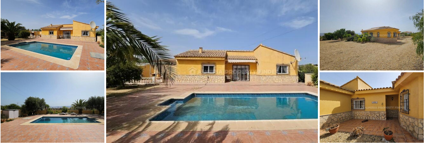
Villa La Hortichuela - A villa in the Albox area. (Resale)

Discover luxury living in Albox with this stunning villa. Boasting 3 bedrooms, 3 bathrooms, and a generous 118m 2 build, this property offers the perfect blend of comfort, convenience, and style.