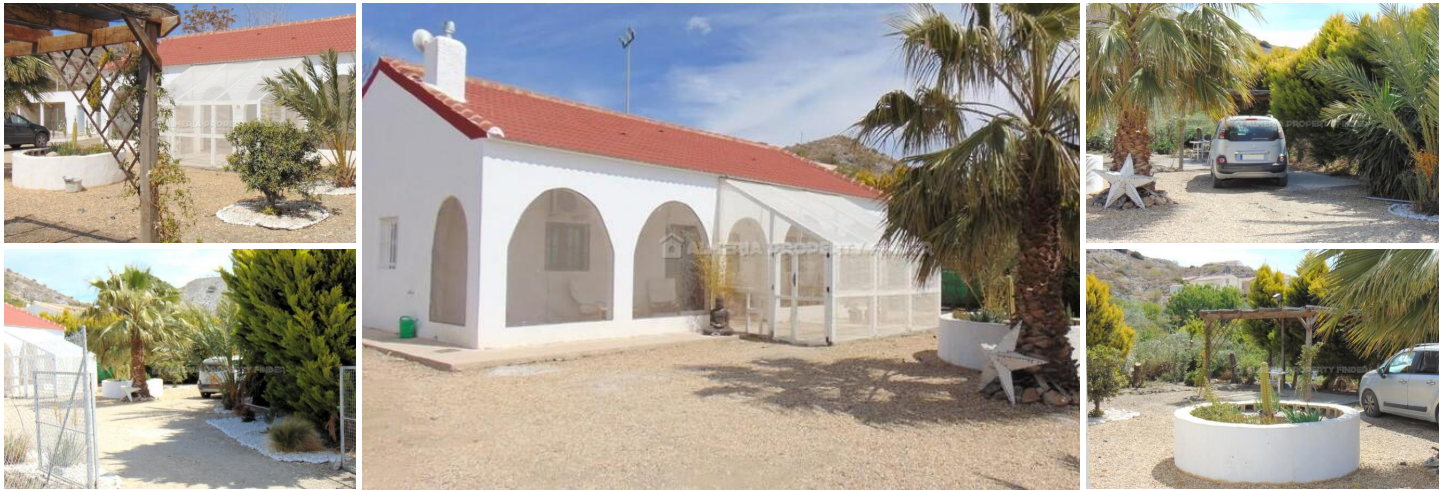
Cortijo Fuente - A country house in the Rambla de Oria area. (Renovated)

A detached villa of 107 m 2 set on a fully fenced level plot of 2301 m 2 and connected to mains water and electricity and a septic tank was also recently installed.