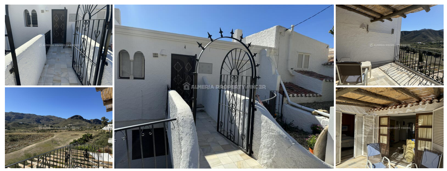
Apartment Euna - An apartment in the Cortijo Grande area. (Resale)

Mashariki, Cortijo Grande: For sale we offer a lovely apartment over-looking the old golf course and offering the most exquisite views of the mountains and the surrounding countryside. Located a short drive from the town of Turre the apartment provides peace and tranquility. It comprises hallway, fitted kitchen, living room with access to the spectacular terrace, master bedroom with glorious views, second bedroom and the bathroom.