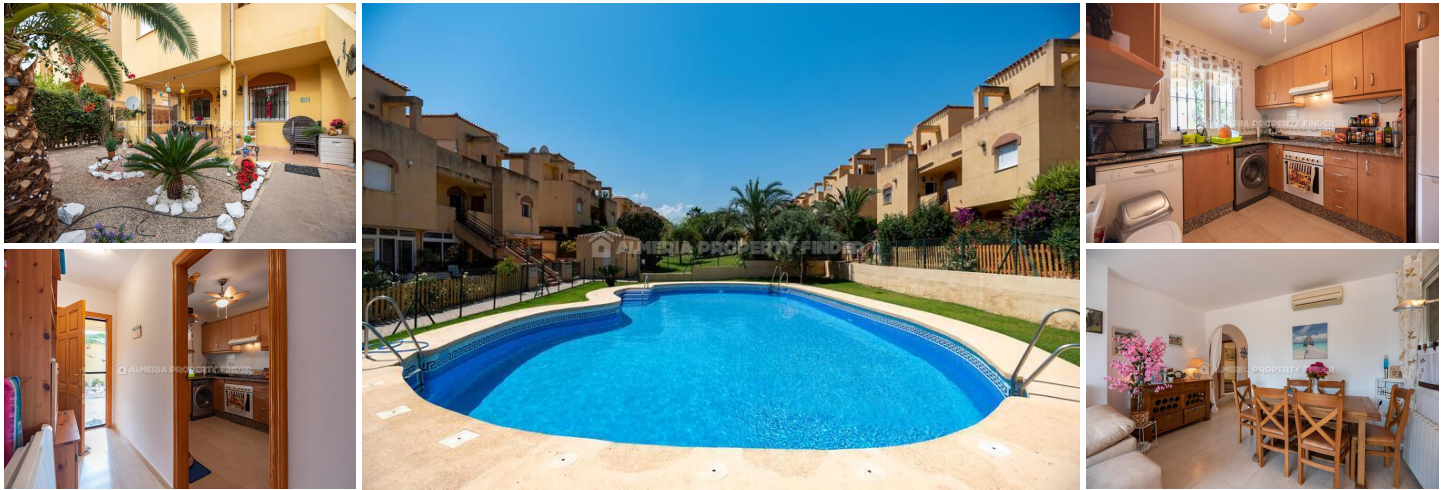
Apartment Wyatt II - An apartment in the Los Gallardos area. (Resale)

Residencial Los Naranjos, Huerta Nueva: Beautifully presented and spacious ground floor apartment with a lot of good outside space, close to the communal pool with allocated parking and low community fees. The property has been well decorated with good presentation. It comprises partially covered entrance terrace, living room / dining room with access through patio doors to the rear garden, well fitted kitchen, guest shower room, master bedroom with en-suite bathroom and a further double bedroom. The living room and both of the bedrooms have Air Conditioning and both bedrooms have fitted wardrobes. Gas central heating is available and all of the rooms have radiators. The back garden measures approximately 9 x 5 and there is plenty of storage.