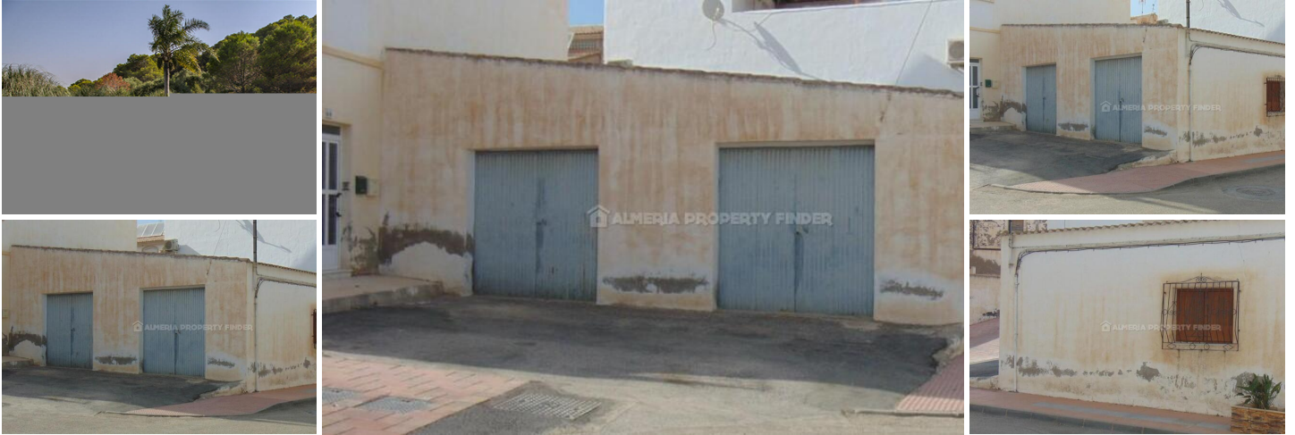
Cochera Calvario - A commercial in the Zurgena area. (Resale)

Built area 59m 2 , ground area 59m 2 , 1 floor, 2 gates, parking space for 2 cars.