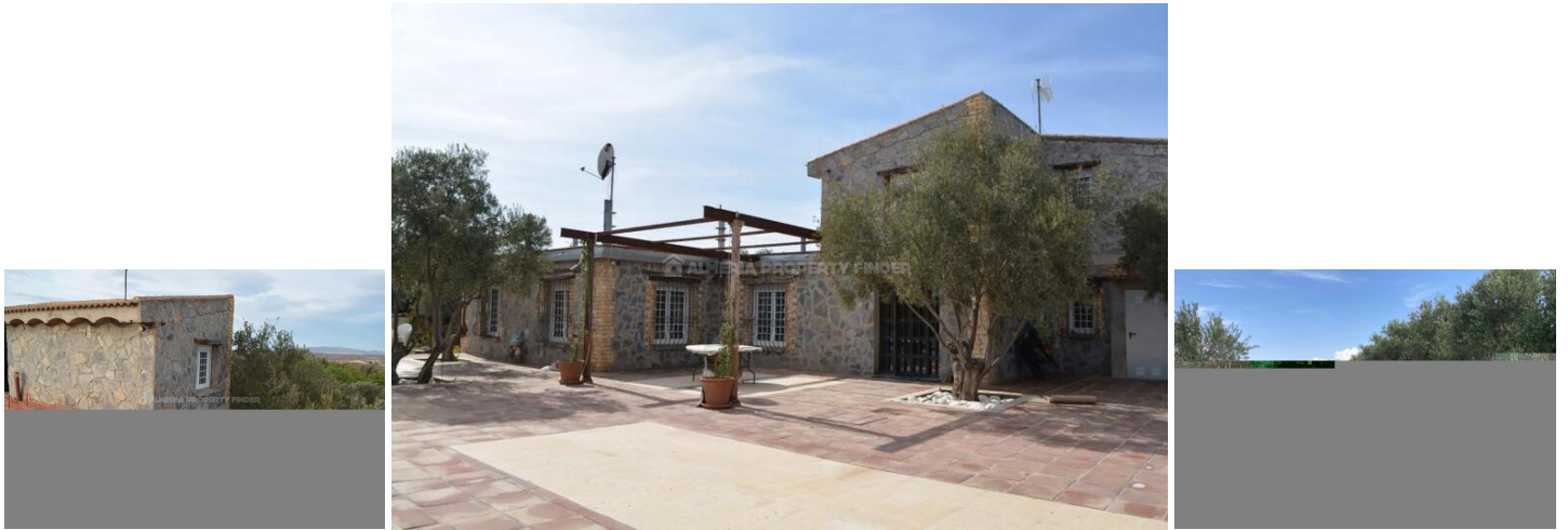
Cortijo Palmeras - A country house in the Baza area. (Renovated)

Cortijo with 1191 m 2 built, of which 304 m 2 usable area, 7745 m 2 plot area, 4 bedrooms, 2 bathrooms, 2 toilets, fully equipped kitchen, spacious living area, 2 swimming pools, palm trees and olive trees, pellet stove, pre-installation central heating, shutters, terraces, parking