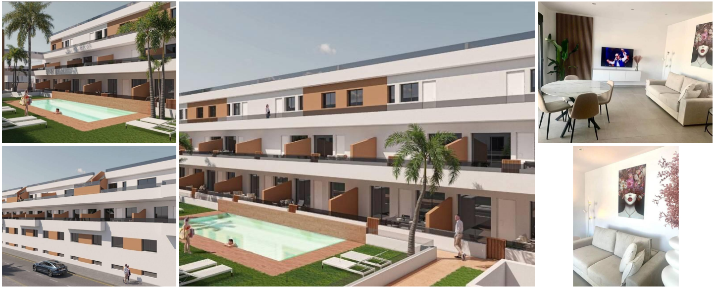
NEW BUILD RESIDENTIAL COMPLEX IN PILAR DE LA HORADADA

New Build residential of apartments and penthouses in Pilar de la Horadada.