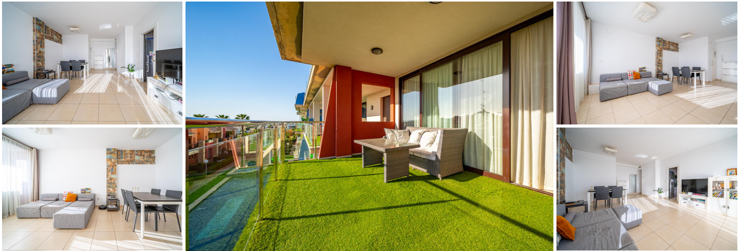
3-bedroom apartment in Lomas de Cabo Roig with sea views

Second-floor apartment in a private residential complex with 3 bedrooms and 2 bathrooms. The property offers a spacious living-dining room, separate kitchen, and a large terrace with artificial grass and a sofa overlooking the communal areas.