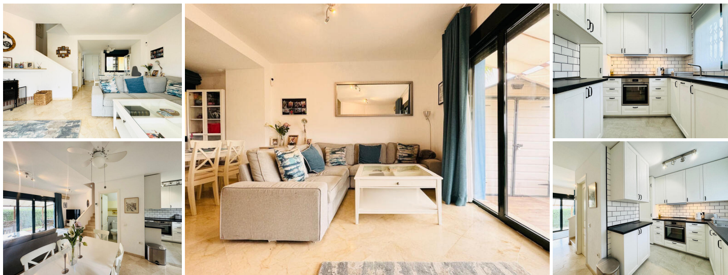
Semi detached house in La Duquesa

Welcome to Torres del Golf, a small, gated community with immaculate gardens, a swimming pool and allocated parking. Ideal for a family, this property offers plenty of indoor and outdoor space, access directly from the garden to the communal swimming pool, sunshine all day round and gorgeous mountain views. Situated just a few minute drive away from all local amenities and La Duquesa Marina, the property offers the perfect blend of tranquility and convenience.