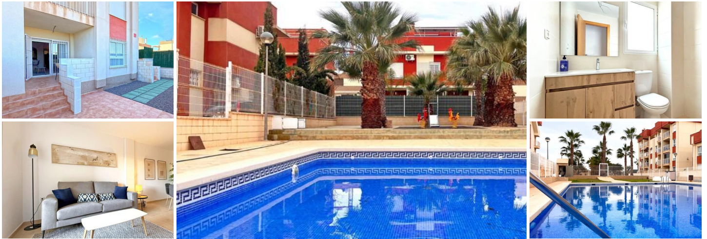
Corner Apartment with Large Garden and Sunny Terrace in Lomas de Cabo Roig

This beautifully renovated corner apartment in Lomas de Cabo Roig offers a spacious 117m 2 private garden, providing the perfect setting for outdoor living. With modern finishes and a bright, open-plan design, this property is ideal for those looking for comfort and convenience on the Costa Blanca.