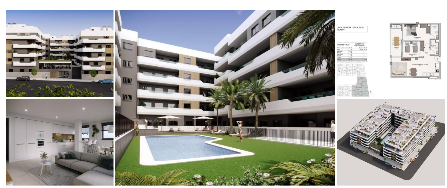
NEW BUILD RESIDENTIAL COMPLEX IN SANTA POLA

New Build modern gated residential complex consisting of 1, 2 and 3 bedroom apartments and penthouses with 2 complete bathrooms. The complex consists of 4 staircases of flats with spacious landscaped communal areas, including swimming pool, relaxation area and gymnasium.