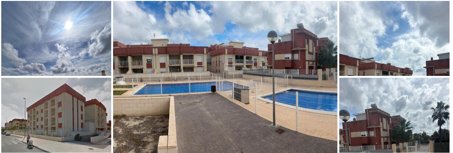
Regenerated Residential Complex in Lomas de Cabo Roig – Renovated Apartments