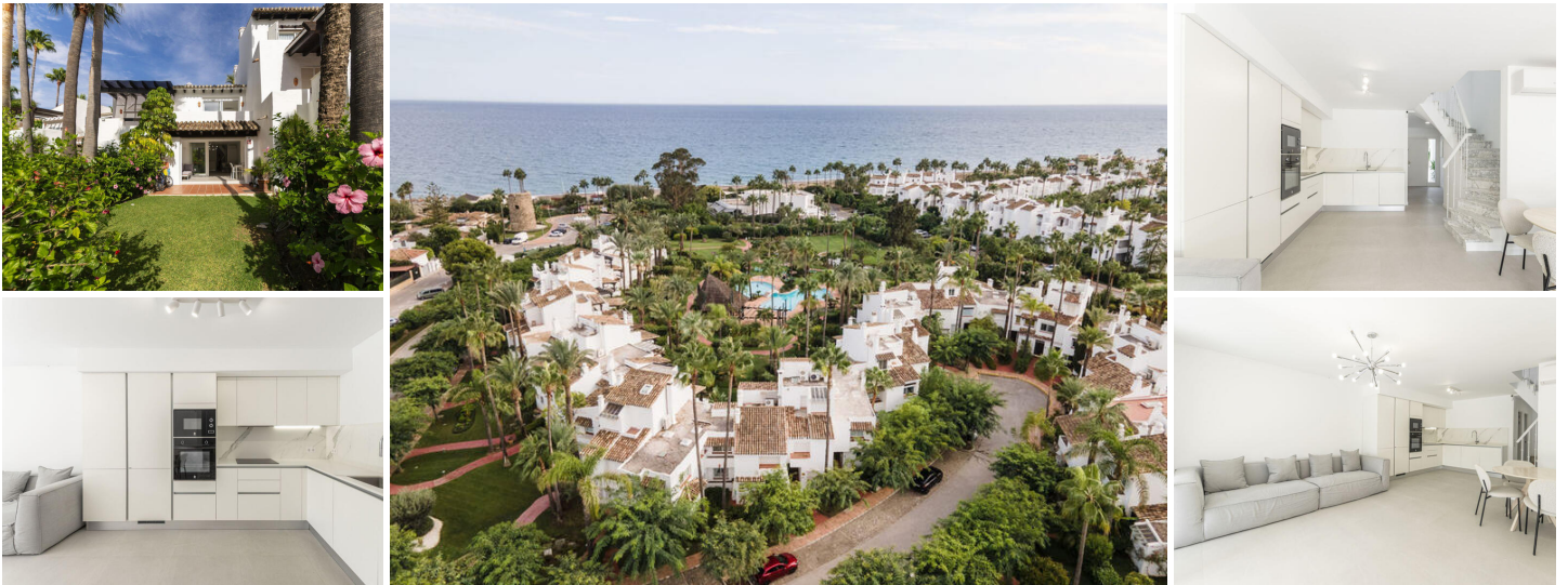
3-Bedroom Townhouse in Urb. Costalita, New Golden Mile, Estepona

This charming 3-bedroom, 3-bathroom townhouse is situated in the prestigious Costalita urbanization, in the heart of Estepona's New Golden Mile. With a two-story design, this property offers both comfort and space.