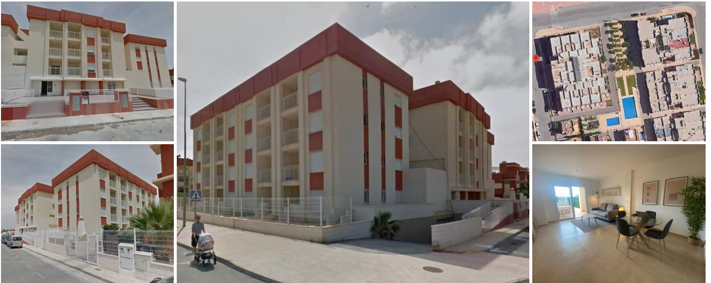
Regenerated Residential Complex in Lomas de Cabo Roig – Renovated Apartments