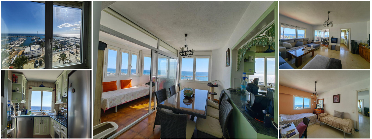
Prime Frontline Marina Apartment in Puerto Paraíso – Unmatched Views & Investment Potential

Discover a rare opportunity to own a frontline marina apartment in the highly sought-after Puerto Paraíso*urbanization, situated in the vibrant Port of Estepona. This fourth-floor, 2-bedroom, 2-bathroom apartment boasts breathtaking South and East-facing views of the marina, the shimmering Mediterranean Sea, and the scenic coastline.