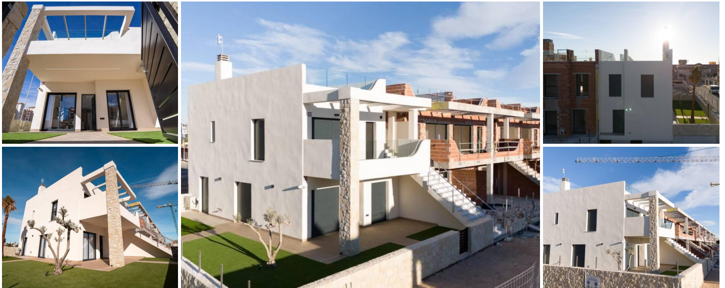
New build bungalows in Pilar de la Horadada