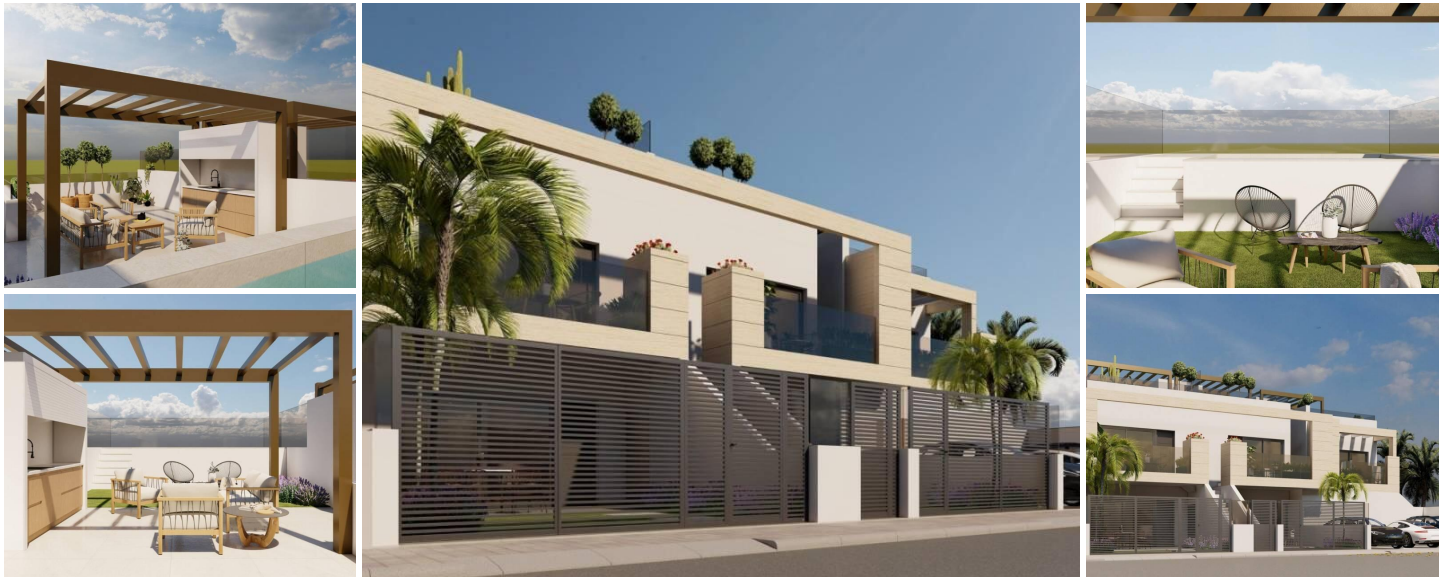
New Build Bungalows in Lo Pagán: Modern Living Near the Beach

Prime Location in Lo Pagán, San Pedro del Pinatar