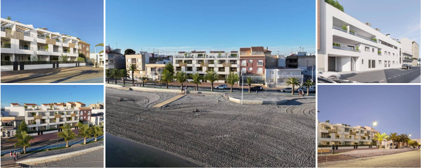
NEW BUILD FRONTLINE RESIDENTIAL IN SAN PEDRO DEL PINATAR

Nestled along the captivating Mar Menor, Lo Pagan is a town in Murcia that unveils a seamless blend of natural beauty and cultural richness, offering a perfect escape for those seeking a tranquil oasis.