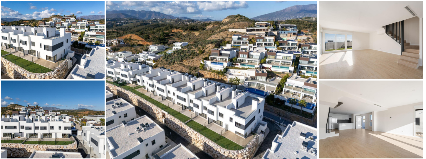
Stunning 4-Bedroom Corner Townhouse in Serena Village, La Cala de Mijas

Welcome to this exceptional 4-bedroom, 3-bathroom corner townhouse in Serena Village, one of the most sought-after gated urbanizations in the heart of La Cala de Mijas. Recently completed, this development offers an unrivaled blend of cutting-edge design, top-tier materials, and luxury finishes. Situated on the higher levels of the urbanization, this home enjoys panoramic sea views from every level, culminating in an expansive rooftop solarium where you can soak in the vistas while basking in the sun.