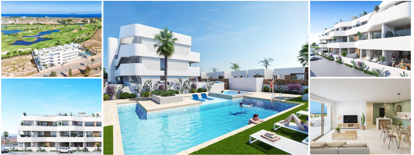
New Build Residential complex in Los Alcazares

Los Alcázares is an idyllic location for those looking to invest in a new residential property on the Costa Cálida. Just 25 minutes from Murcia Airport and approximately 55 minutes from Alicante Airport, this area is conveniently connected by highway to major cities like Cartagena, Murcia, and Alicante, as well as to other beautiful beaches along the Costa Cálida and Costa Blanca.